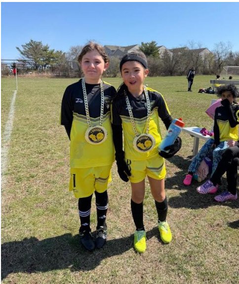
PSC Pride at the Gotham FC Game, the metropolitan area's women's professional soccer team.